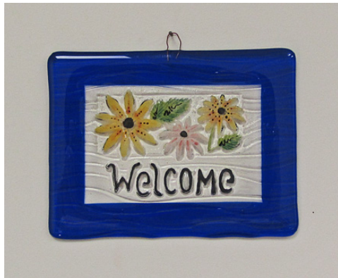
Standard Thickness COE 96 clear over a border of Cobalt Blue with wire U-hook inclusion texture on DT01 Welcome and painted post firing on reverse with Color Magic non fired paints.