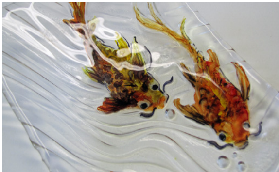
Color Magic products applied from the texture side and viewed from the reverse.