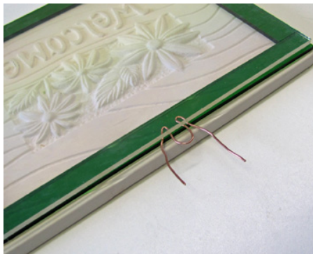
Illustration of bare copper wire between fusible glass accent strip border and compatible standard thick clear