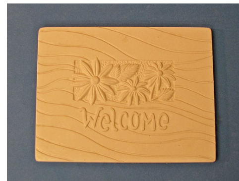
DT02 Welcome Texture 8" x 6.5"