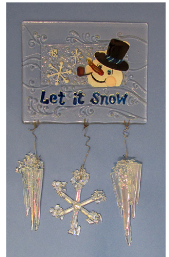
(Above) Double Thick Clear glass textured on DT02 Snow Texture with U-hook wire inclusions to hang fused snowflakes/icicles. The textured glass was painted on reverse using Color Magic non fired paints