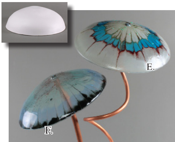
Slurry mushrooms formed on GM207

To place the fired caps on stems with a screw: Use a diamond encrusted core bit (1/4" or 3/8" dia.) to drill holes in the center of the caps. Place a plastic wall anchor (#6-#8) into the end of a 1/4" copper tube. Place #6 washers on either side of the glass and a #6 screw through the washers into the plastic wall anchor in the copper tube.