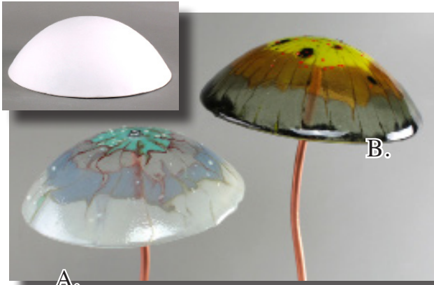
Slurry mushrooms formed on GM206

There are a wide variety of techniques available to make fun mushrooms using Creative Paradise, Inc. drape molds, GM149, GM206 and GM207. One fun and easy technique to create glass to shape into mushrooms on the molds is by using the "frit slurry" technique. To learn more about making frit slurries, find information by clicking here: Frit Slurry Basics.