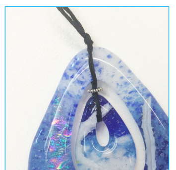
Step 3: Tie a knot in the cord just above the large pendant.