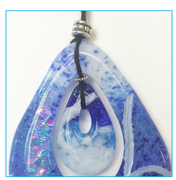
Step 4: If desired, hide the knot by placing a larger bead over it on the cords.

This same method works for stringing/beading just a single pendant too, all you have to do is adjust it a little to work for your single.