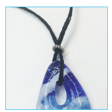
Step 1: Put both sides of the cord through a small spacer bead and run bead down the cords to the top of the small pendant.