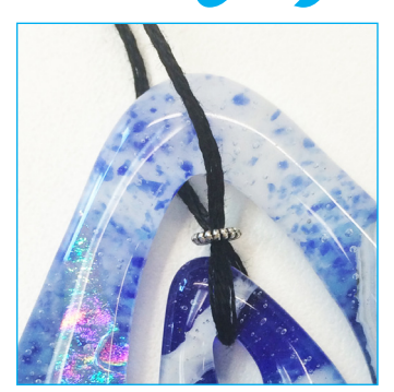
Step 2: Place the large pendant between both sides of the cord, on top of the spacer bead.