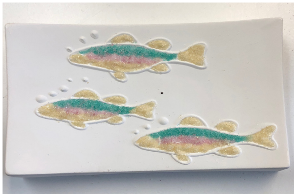
Fill the empty parts of the fish with F2 Pale Amber Trans.