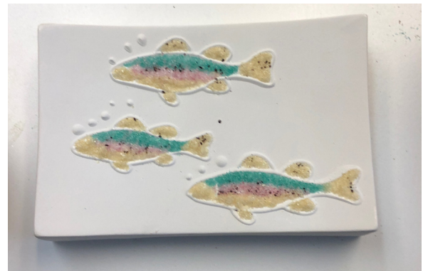
Sprinkle some F2 Black frit here and there on the fish bodies.