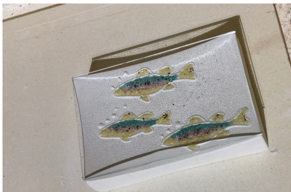
Cut a 5.75" x 3.5" rectangle out of 3m clear fuse-able sheet glass and place it on the mold in your kiln. Fire using the schedule found in table 1.